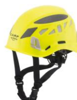
3 - Fluo yellow / Reflective grey