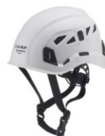
7 - White