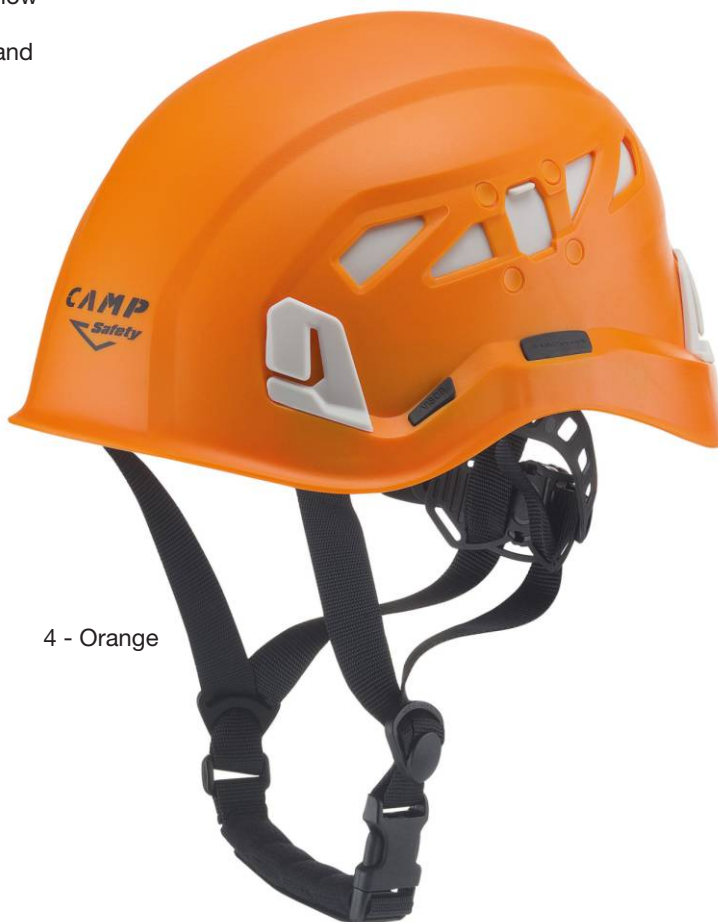
4 - Orange