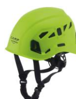
6 - Green