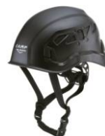
8 - Black